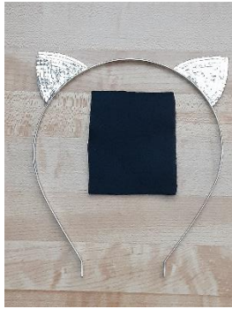
Cat ears and felt