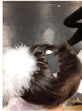
Velcro clip on top of heae Put ears on and then press the Velcro from the felt extender onto the clip. Bobby pins that blend With the hair color may be On the sides of the headband.