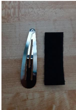
Securely sew the other side of the Velcro to top side of the Pop clip.