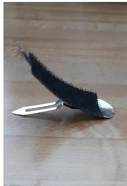
Please note: Self stick Velcro does not permanently adhere to metal or fabric and so it must be sewn in place