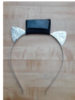
With the extension reaching towards the bun, sew Velcro to the underside.